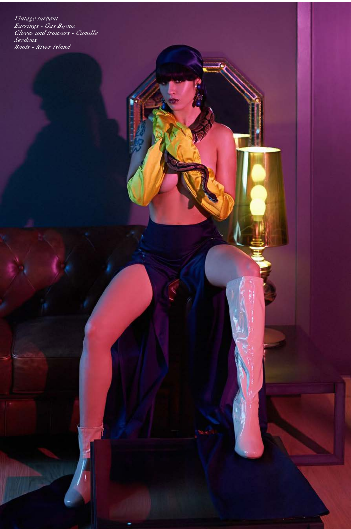
Vintage turban Earrings - Gas Bijoux Gloves and trousers - Camille Seydoux Boots - River Island