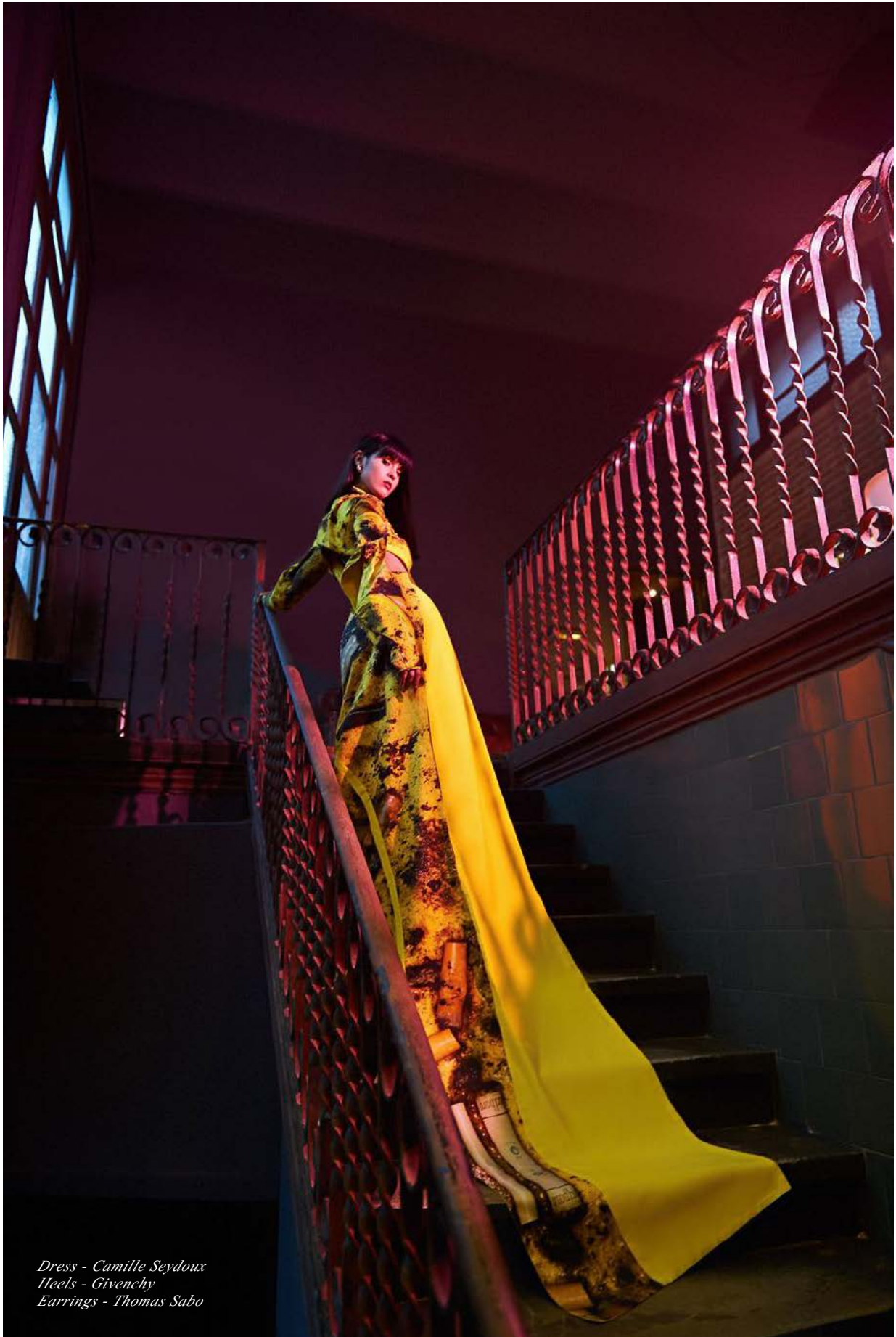
Dress - Camille Seydoux Heels - Givenchy Earrings - Thomas Sabo